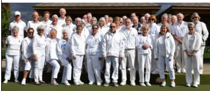
Group Photo - AGM 2018