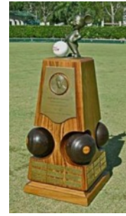
The "Disney Masters Tournament" trophy

Walt Disney was an avid bowler and, after he died, the Beverly Hills Lawn Bowling Club started the Disney Masters Tournament that continues to this day, now in its 4th decade.