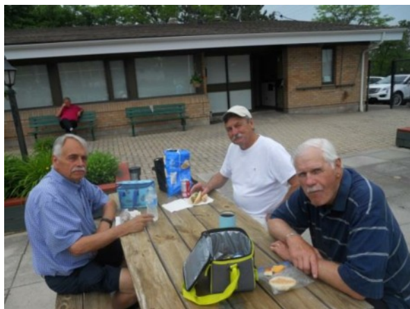
Team M discussing tactics