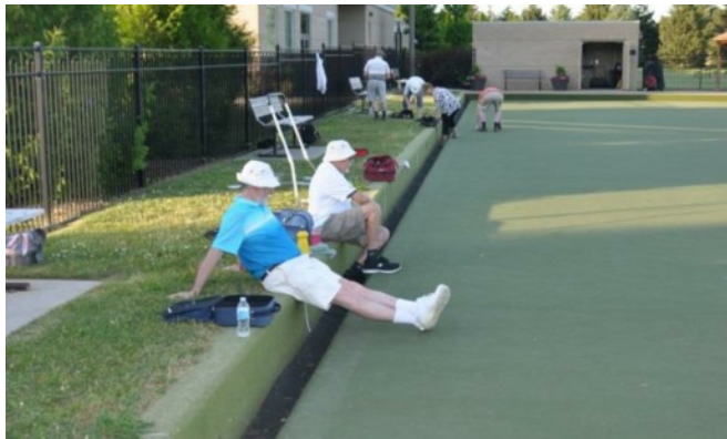
Oh: the Excitement of FLOP's

There is actually some excellent bowling happening on Friday evenings and if you do not come out to watch, you’re missing all the action!