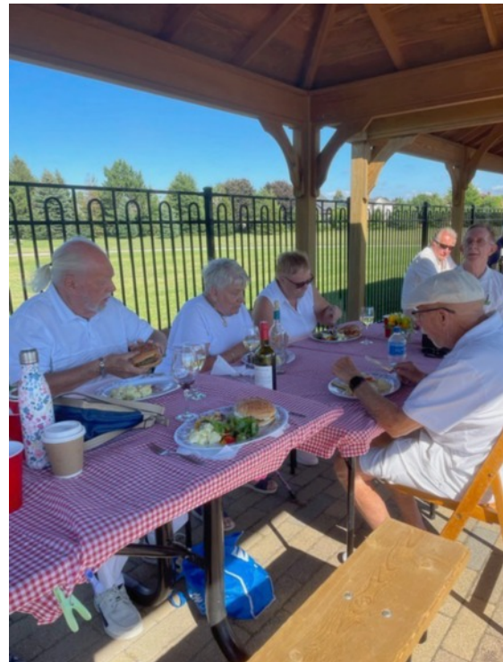
Good food, good company!