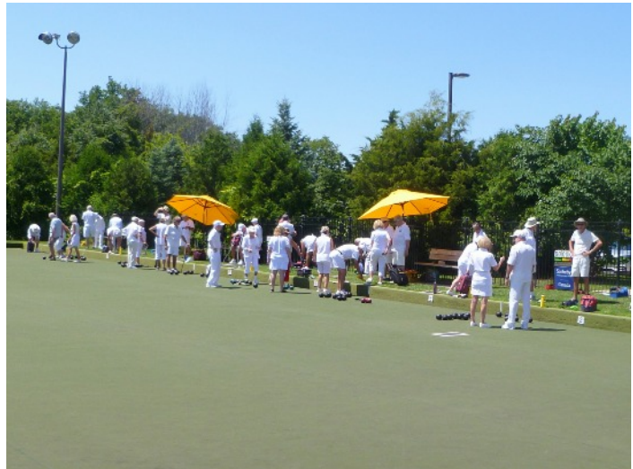
All 38 out on the Green to start the first end.