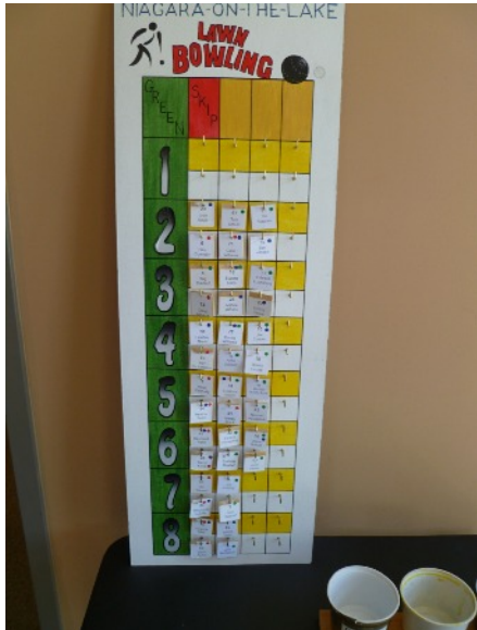
38 Bowlers, 7 lanes used!!